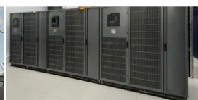
Online UPS systems