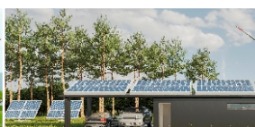
Stand alone Off Grid Solar System