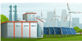
Hybrid Solar Systems